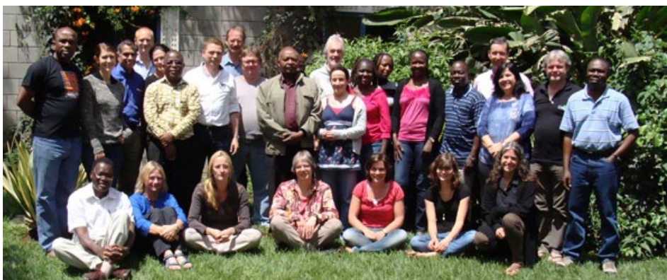
Group photo (click it for a larger version) of the Steering Committee and Leadership Team meeting of N2Africa in Nairobi in May 2012