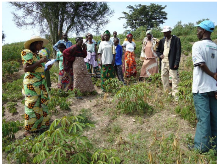
Picture 1 Participatory evaluation of a demonstration plot on Beans and Cassava, Kamonyi, January 2011

En tant qu'agent de liaison, les tâches sont multiples et variées. Tout commence par la planification des activités saisonnières, elles même basées sur les objectifs à court terme du projet. La planification saisonnière constitue le fil conducteur des activités le long de la saison culturale pour chaque partenaire au niveau de sa zone mandataire respective.