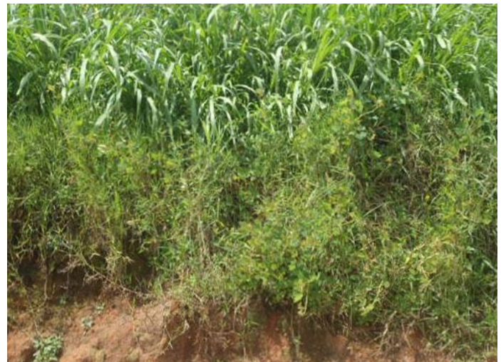
Desmodium intortum established along with Pennisetum spp. in eroding contour Helen's farm

Livestock keeping is a traditional practice of Banyarwanda (the people of Rwanda) as it provides families with income especially from sale of milk, meat and offspring. It also provides for manure, which is utilised as a cost-effective fertiliser to revitalise soil quality. Undeniably on the "eyes" of many Banyarwandas, having livestock is also a sign of wealth. Following civil strife in 1994, many farmers lost their animals and the livestock population in Rwanda decreased considerable. Under 'One Cow Per Poor Family' program the poor and vulnerable families, including genocide survivors, widows, orphans, people with disabilities and people living with HIV/AIDS, are acquiring productive assets in the form of a dairy cow or dairy goat. These groups are also provided with an integrated package of assistance, starting with participatory training that strengthens the social structures and gender equity. At the same time the groups are given in-depth training in sustainable organic agriculture, concentrating on vegetables, maize and beans for human