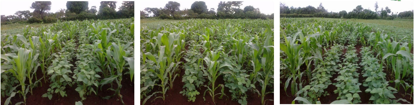
On the left density 1:2, in the middle density 1:1 and on the right density 1:3 at Butere site (midland zone) during 2012 long rains growing season

as costs involved are recorded to evaluate the effectiveness of the systems and to determine the appropriate intercropping patterns for smallholder farmers. Margarida started her field work in the 2011 short rains growing season (September-December) and her work continues into the current 2012 long rains growing season (March – June 2012).