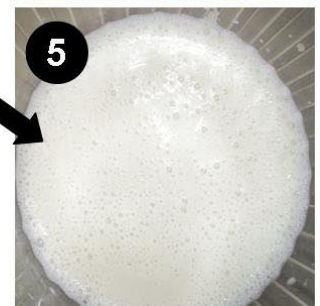
1) apparatus assembled for only $70. 2) soaked soybeans. 3) minced soybeans. 4) soybean press cake. 5) soymilk after boiling.