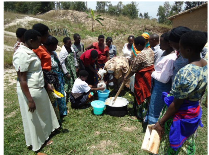
Picture 2 Training of women on soymilk extraction at household level, September 2011

As a farm liaison officer, a daily work comprises of various duties. The starting point is the planning of seasonal activities for each project partner based on milestones per objective before the beginning of each cropping season. From there a work plan is prepared which has to be followed with scrutiny. For a FLO, a monthly schedule is prepared based on the work plan of each partner, with an updated weekly plan to accomplish what is in the seasonal plan.