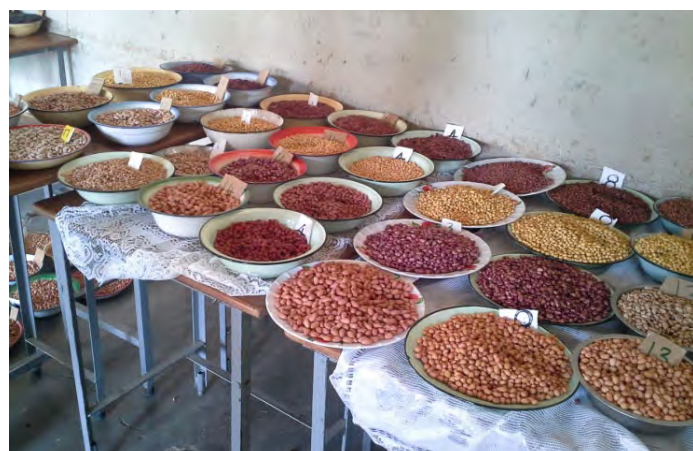
Figure 1. N2Africa beneficiaries were among some of the farmers who won at the 'ward' shows and subsequently brought their produce to the district agricultural shows during August

During the period June-September, N2Africa activities in Zimbabwe focused on local level value addition of grain legumes through nutrition workshops that involved mostly women farmers and dissemination of project technologies at both ward and district agricultural shows, which are annual events. These activities were held in all the five districts where N2Africa is implementing activities, in