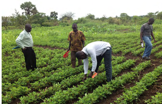
World Vision's Farmer field school facilitator (bending) examining groundnut pegging on one of the on-farm demonstration trials in Minakulu Variety demonstrations