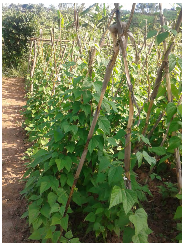
Maize stems methods at Rwaza site