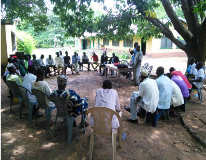
Farmer feedback meeting held at one of the N2Africa sites

Two persons employed for the World Bank SecureNutrition