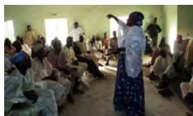
Pre-season training in Kano State (left), Kaduna State (middle) and Niger State (right)