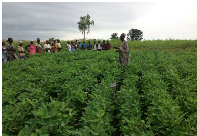
A lead farmer conducting farmers round a demo plot during a field day