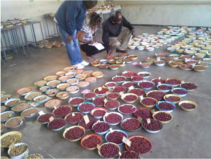
Figure 3. 'Judges' assessing quality of grain legumes brought to the agricultural show by farmers in Makoni district

The Cluster Agricultural Development Services (CADS), a local NGO, has emerged as an important N2Africa partner implementing activities primarily in Goromonzi, Murehwa and Mutoko districts. During August and early September,