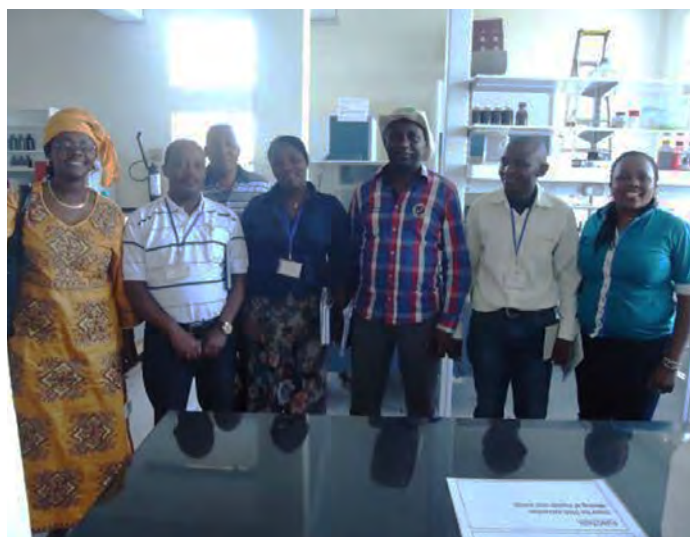
Image 2: From left to right: WfWi officer in charge of partnership, WfWi vice director, WfWi income generator, N2Africa DRC coordination, WfWi field technician and N2Africa Research technician