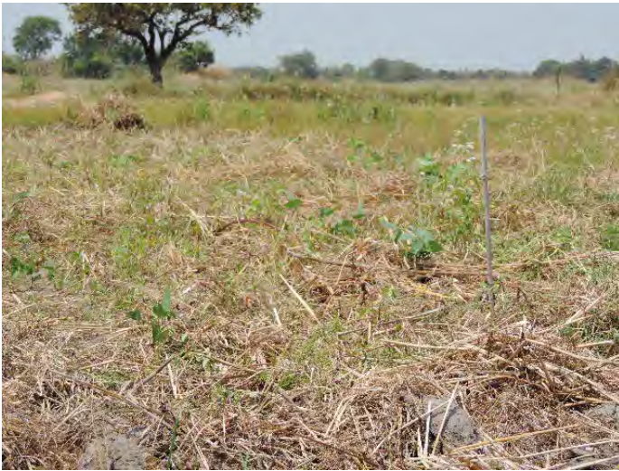
A poorly established and growing cowpea crop at Mkula ward. The crop was planted late on a heavy clay soil. The top soil layer dries up faster limiting proper weeding.

N2Africa approach of development to research and adaptation. The Results so far indicate that crop establishment and growth varies with site and management. Poor crop establishment and growth are observed on heavy soils, compounded by poor crop management (late planting and inadequate weeding). Inherent low soil fertility and poor soil structures as a result of wet cultivation for preceding rice also limit crop establishment and growth. Management of soil moistures is also key in this rice-grain legume rota-