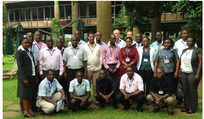
Participants at the National partners meeting held at Kabira country club, 19-20 th June 2014

A national stakeholders meeting was held in June 2014. Beside the lead dissemination partners (World Vision Uganda, VECO Uganda and Africa 2000Net work Uganda), ZOA is interested in disseminating N2Africa technologies to farmer associations they work with in parts of North-