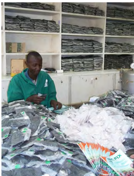
Figure 2. Recovery of cured BIOFIX inner packages prior to sealing into outer sachets. Every batch of BIOFIX undergoes independent quality inspection by MIRCEN-Nairobi under arrangements with N2Africa.

So progress by N2Africa continues in Kenya. Our ability to foster dissemina-