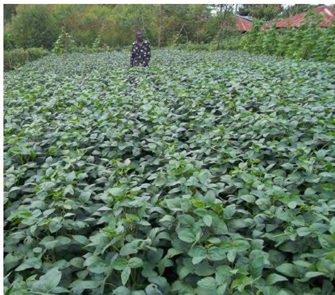
Figure 1. Farmers working with N2Africa have mastered soyabean production using recommended disease-resistant varieties, inoculants, fertilizer and spacing as illustrated by the performance of SC Squire at Ongai Farm, Vihiga

Training in BNF technologies and grain legume enterprise continues. It now focuses upon extension agent liaison skills, grain legume marketing and legume processing, with 47 trainees scheduled for 2014. Training relies upon extension materials developed during Phase 1, with 4500 copies of the "green booklets" reprinted and distributed through various means. N2Africa Master Farmers now lead training in BNF technologies organized by other organizations using N2Africa's training materials (the abovementioned green booklets).