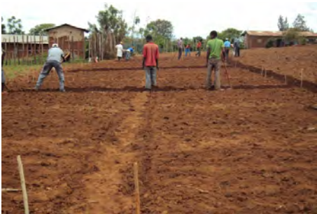
Figure 1. Land preparation for common bean trial at Bako