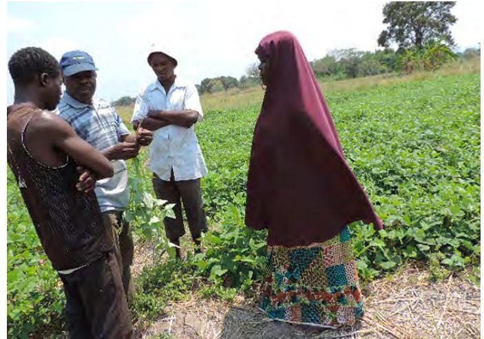
A well performing demonstration on cowpea GAPs at Idete ward in Kilombero district. The crop was planted after harvesting rice to utilize the residual moisture. A farmer (a woman in the picture) applied rice straw as mulch to conserve the soil moisture.

N2Africa approach of development to research and adaptation. The Results so far indicate that crop establishment and growth varies with site and management. Poor crop establishment and growth are observed on heavy soils, compounded by poor crop management (late planting and inadequate weeding). Inherent low soil fertility and poor soil structures as a result of wet cultivation for preceding rice also limit crop establishment and growth. Management of soil moistures is also key in this rice-grain legume rota-