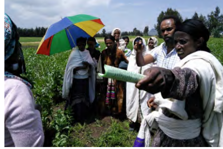
Figure 2. Active participation of women farmers in the field evaluation of faba bean trials at Dabat woreda