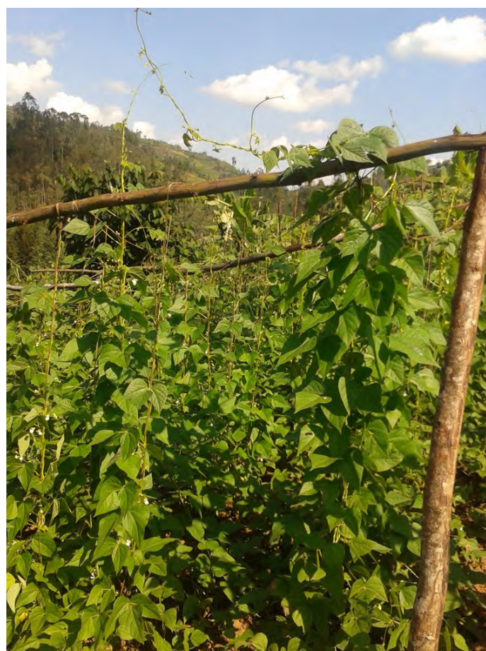
Sisal strings method in Kinoni site