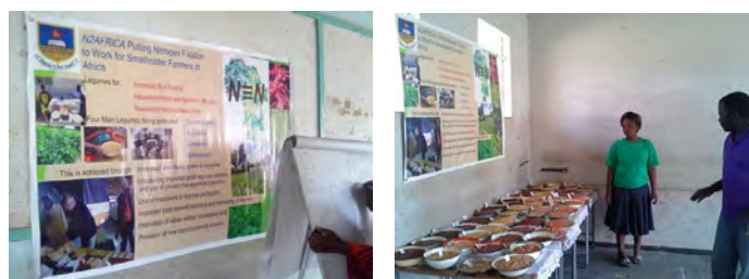
Figure 2. Banners with the N2Africa message (left) were distributed to partners and attracted attention at agricultural shows as the message was coherent with the N2Africa exhibits (right)

For effective communication, we produced and distributed banners to all our key stakeholders in the districts (Figure 2). The banners attracted a lot of attention from farmers, NGO partners and government representatives at the agricultural shows. Two Members of Parliament attended one of the agricultural shows and we took the opportunity to explain to them the objectives of N2Africa.