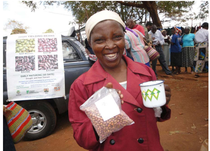
Open market sales central Kenya

BIOFIX legume inoculant resulted from product licensing by the University of Nairobi MIRCEN laboratory, one of N2Africa’s earliest partners. Now, the inoculant is produced at MEA’s factory in Nakuru for several legume hosts (soyabean, bean, pea, green gram, lucerne and others) in a variety of packaged quantities (10, 20, 50, 100 and 150 g). MIRCEN continues to offer quality control inspection