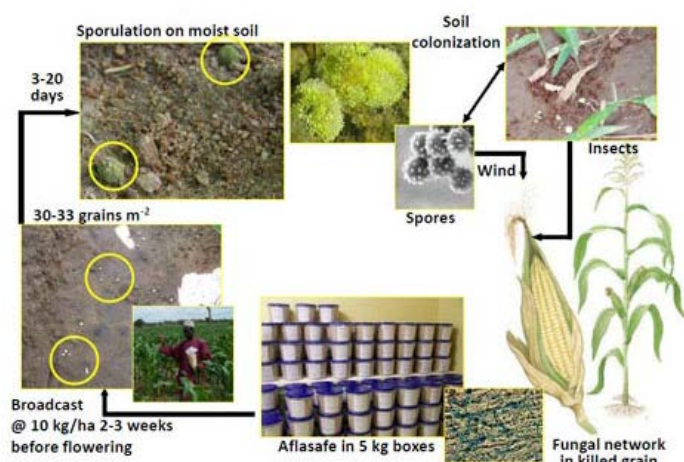
Figure derived from the related link: http://www.aflasafe.com/aflasafe