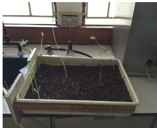
Figure 1 and 2: Discussing the poor seed germination rate at the field of Mrs Dorcus and germination verification tests at the Makerere University, Uganda.