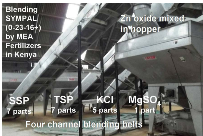
Photo 1. Sympal production at the MEA blending facility in Nakuru, Kenya

Sympal is a fertilizer blend developed by N2Africa and commercially produced and distributed by MEA. It contains no mineral nitrogen, but offers a balanced supply of phosphorus, potassium, calcium, magnesium, sulfur and zinc. This fertilization strategy optimizes biological nitrogen fixation by assuring that mineral nutrient supply remains non-limiting. This blend was formulated by N2Africa, proto-types packaged by MEA and distributed free-of-charge, tested and refined through on-farm testing by WeRATE and the final product then produced at MEA's blending facility in Nakuru. Selling Sympal presents no challenge, especially for use on inoculated soybean, because the plants become dark "blue" and yield increases by about 700 kg ha -1 . Appreciation of Sympal extends well beyond our network as over 128 tons of this product were blended and marketed by MEA over the past few years. It is available in 2, 10 and 50 kg plastic lined woven polythene bags. Sympal is very effective when applied to inoculated pea as well, but less so with bean. As a result, MEA formulated and markets a sister product "P Mabau" that combines Sympal with 10% mineral nitrogen. Use of this new product on soyabean at 125 kg ha -1 on 25 farms in west Kenya during 2015 slightly increased yields, but not sufficiently to offset the fertilizer's higher price.