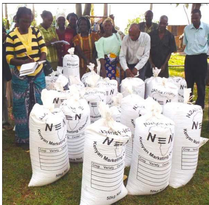
Photo 2. Soyabeans delivered to a marketing collection point in west Kenya contained in N2Africa branded grain sacks

Grain legume seed is widely produced and marketed throughout Kenya by several seed companies. These seeds include bean, pea, green gram, forage and fodder legumes and most recently soyabean. N2Africa and WeRATE conducted widespread testing of soyabean in west Kenya, examining several traits such as seed size, protein and oil content and "dual purpose" growth habit. Ultimately, varietal choice was largely determined by tolerance to Asian Rust, a foliar fungal disease outbreak that occurred after soyabean production grew in popularity. Two soyabean varieties, SC Saga and SC Squire, developed by Seed Co are extremely resistant to rust. SC Saga was licensed for distribution in Kenya in 2014 and is first appearing on stockists shelves in west Kenya. Meanwhile,