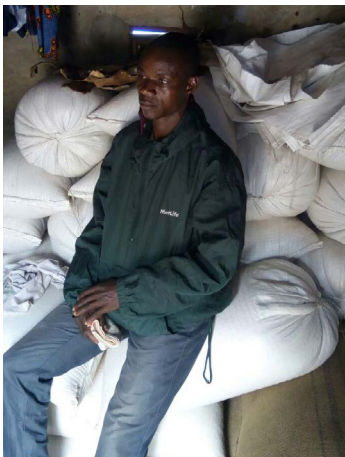
Bags of unsold soyabean in a farmers room in Saboba District, Ghana