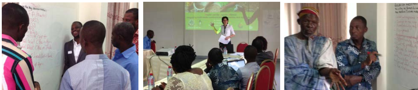
Images 1-3. A selection of photos from the inception event for GALA held at UDS in Tamale, Ghana in mid November

their attitudes and behaviour – with a specific interest in women and younger farmers. The work is funded by Bill & Melinda Gates Foundation (ASHC) and UK Aid ( Gender and the Legume Alliance ).