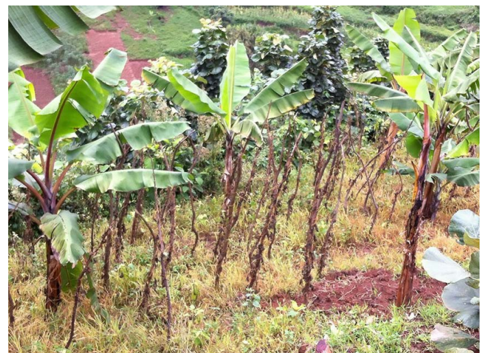
Image 1. Damage by rats

In the Southwestern highlands of Uganda (Kabale and Kanungu Districts), damage by rats was an evident problem. Rats cut bean stems, leaving the crop to perish (Image 1). Nest-box schemes for rodent control by owls have been