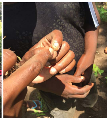
Explaining soyabean seed producers in Zambezia how to identify active nodules