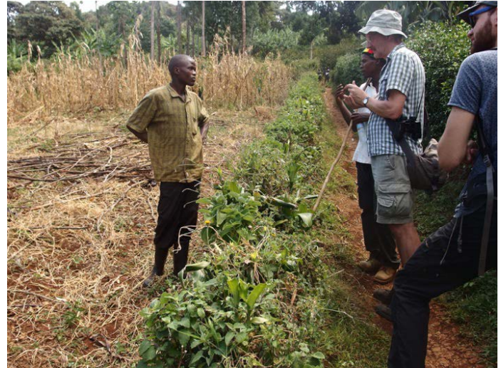
Image 1. On Christmas holiday I had the chance to discuss climbing beans with a farmer who was tidying up his stakes in Kapchorwa, Mt Elgon, Uganda

Welcome to the first Podcaster of 2017. N2Africa activities are running at full speed across the eleven countries. One of the great things about working across East, West and Southern Africa is that there are always crops in the field somewhere. Inside you'll find some photos from field days this week around maturing crops in Malawi and Mozambique. At the same time we have national planning meetings being held in East and West Africa – and we include a report from the Uganda workshop. In Ghana, collaboration with the African Soil Health Consortium is testing some innovative dissemination methods using videos through the GALA project. An internship report on climbing beans in Uganda highlights some unexpected problems faced by farmers due to rat damage and lack of staking materials, and provides some innovative ideas that we can test out in participatory work in the coming seasons.