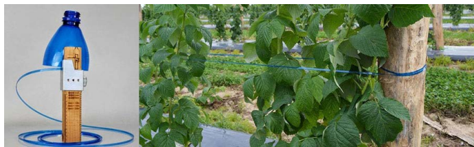
Image 2. Plastic bottle cutter