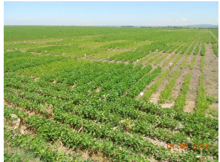
Image 1. Small-plot trial in Frankfort, South Africa testing Rizobacter's inoculants for soyabean.

The firm entered the Kenyan market in 2012 by registering products for soyabean (Rizoliq) and maize (Rizofos). In this region, Rizobacter is firmly committed to making its product available to the smallholder African farmer and thus provide them with the latest technologies which have already been proven to be of great value to commercial farmers around the globe.