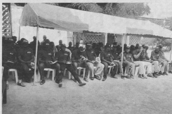
■ A section of the trained Borno Youth Agripreneurs