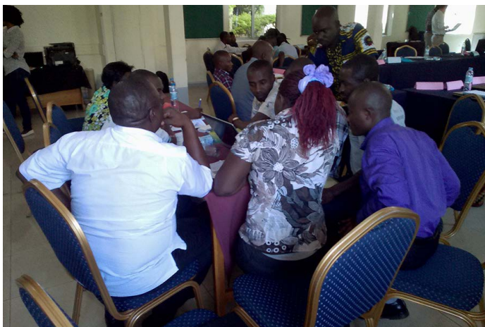
Image 1. Partners during a group session for joint development of 2017 work plans