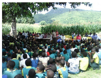
A field day conducted yesterday at a school's demos at Bilala - Ntcheu Malawi