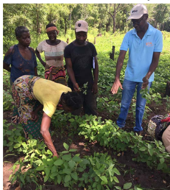
In Zambezia Province explain soyabean seed producers working with ACOF on the importance of thinning