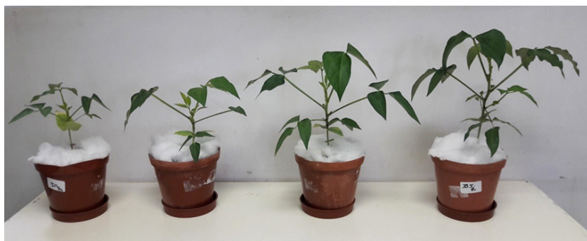
Cowpea plants inoculated with different rhizobia strains isolated from cowpea root nodules sampled from farmers fields in Northern Mozambique

Chibeba, A. M., Kyei-Boahen, S., de Fátima, G. M., Nogueira, M. A. & Hungria, M. 2017. Isolation, characterization and selection of indigenous Bradyrhizobium strains with outstanding symbiotic performance to increase soybean yields in Mozambique. Agriculture, ecosystems