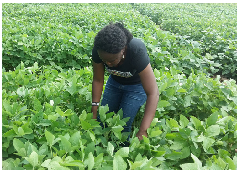
Rainfed soyabean with integrated input bundle (S+P+M+I) that is Supplementary irrigation + Phosphorus fertilizer+ Manure + Inoculant

Methodology: Field experiments were conducted during the 2017 and 2018 cropping seasons at the experimental site of Bayero University Kano (BUK), in the Sudan Savanna and at the IITA experimental site in Lere in the Northern Guinea Savanna of Nigeria to evaluate the use of input bundles in soyabean production systems. The treatments consisted of two soya-