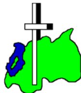
Eglise Presbiterienne Rwanda