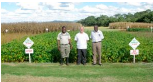
SQ Squire – resistant/tolerant variety shows little difference in defoliation between unsprayed and sprayed plots