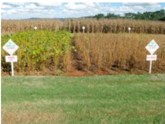
SC Santa – susceptible variety shows large differences in defoliation and yield between unsprayed and sprayed plots