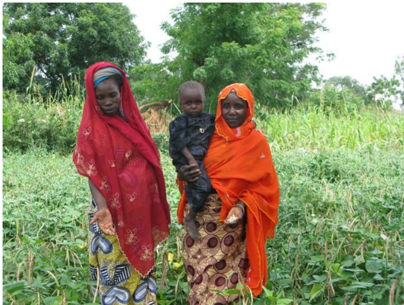
N2Africa farmers showing the large white cowpea seed of the new varieties that are highly valued in northern Nigeria