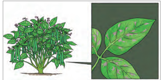
Angular leaf spot

Angular Leaf Spot is a fungal disease which is usually observed at flowering. Primary leaves have round lesions and are usually larger than the lesions on trifoliolate leaves. Lesions are first grey, and then become dark brown in colour. The spots may increase in size and join together. Branches and pods have reddish-brown angular spots. Angular leaf spot is seed borne and seed transmitted.