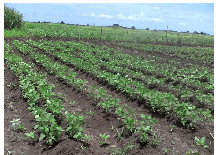
Soyabean growing on heavy vertisols in Caia District, Mozambique

As follow up, a field day was organized on April 16 to visually evaluate the performance of the soyabean varie-