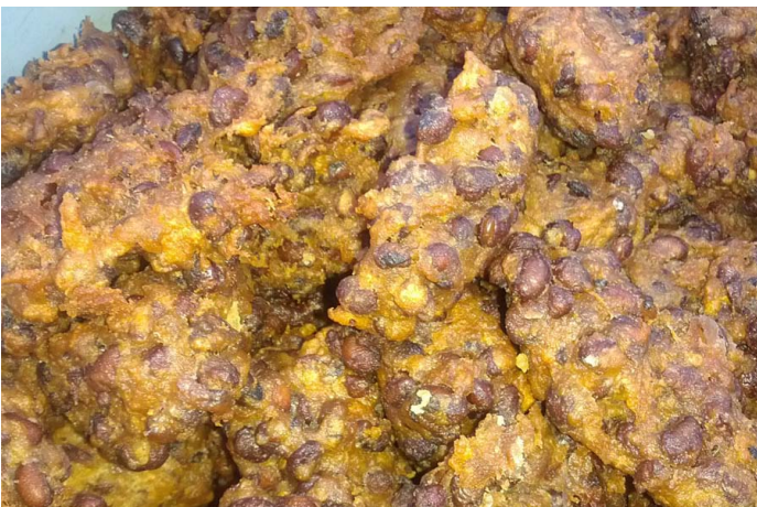
Photo 2 ... and the cowpea fritters are really delicious

in these value addition activities. Through these activities, N2Africa is dismantling the tradition that grain legumes are for women.