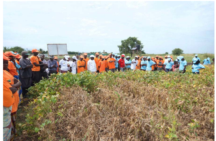
Participants at field day observing different soyabean varieties growing in Caia District

ties. A total of 254 people participated from which 200 were smallholder farmers. Given that for the majority of farmers this was the first time that they had close contact with soyabean, it triggered an active discussion between farmers, the N2Africa coordinator and iDE. Questions such as: where to get soyabean seed, how to process it, where to sell at which prices dominated the discussion. Just to quote a farmer “I heard about soyabean but I never saw it growing. Now that we know that it can be cultivated in Caia where we can get the seed? How do we consume soyabean? Where to sell and what is the price?”