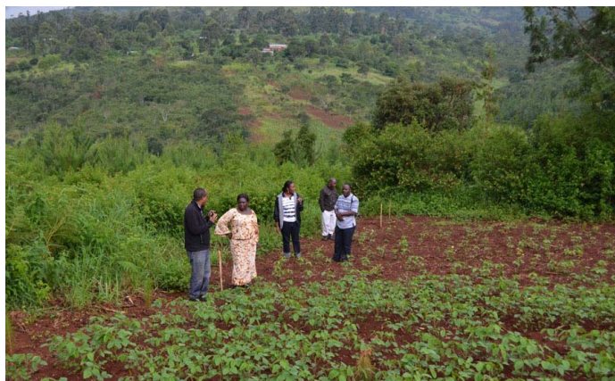
CRS and N2Africa staff discussing some of the problems of seed multiplication in southern Tanzania