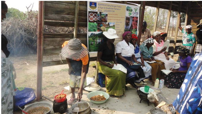
Photo 1 Both men and women participating