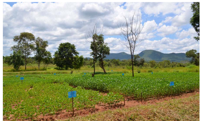
In the south of Tanzania with CRS and the Soya ni Pesa project. Guess - which are the inoculated plots in this on-farm demo?

in demonstration and production of soyabean in Songea, Namtumbo and Ludewa districts; N2Africa-ARI Uyole collaborative trials on soyabean variety evaluation, soyabean disease monitoring and soyabean-maize rotation trials; SILVERLAND company at Makota in Mufindi district (in production of soyabean, manufacturer of animal feed