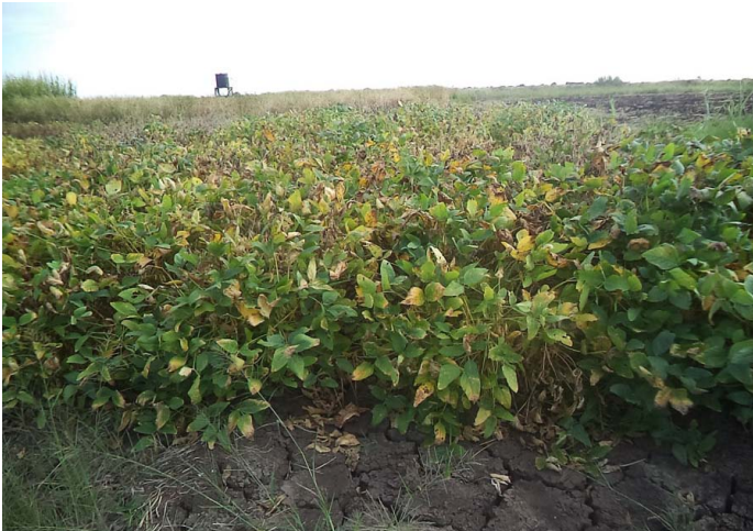
Soyabean crop at late stage of maturity in Caia District, Mozambique