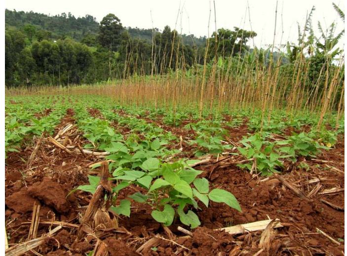
Two distinct climbing bean cropping systems; smaller area climbing bean intercropped in banana-coffee fields and sole cropping on larger fields by 'better-off' farmers.

climbing bean productivity. Main constraints in Kapchorwa were the availability of stakes and, for poorer farm types, land availability. This was a reason why currently 80% of the households cultivating climbing bean did this on a very small area as an intercrop in their banana-coffee fields. Only 20% of climbing bean cultivating households used sole cropping. Farmers cultivating their climbing beans in intercropping had smaller yields than those who grew them as sole crops. The low yields of these small intercropped climbing bean fields could be an entry point for improving climbing bean cultivation. Part of the variation in yields between farms was related to management. For example, higher planting densities were positively correlated with yields. These higher planting densities were two to three times higher than currently advised planting densities. Even though higher sowing densities might not be the 'best agronomic' practice, it can be a cheap and easily accessible option for 'poorer' farmers. 'Better-off' households were more often cultivating climbing bean in sole cropping on larger areas. For these households, options to improve climbing bean productivity would be an increased stake density and better pest control, as these farm types have