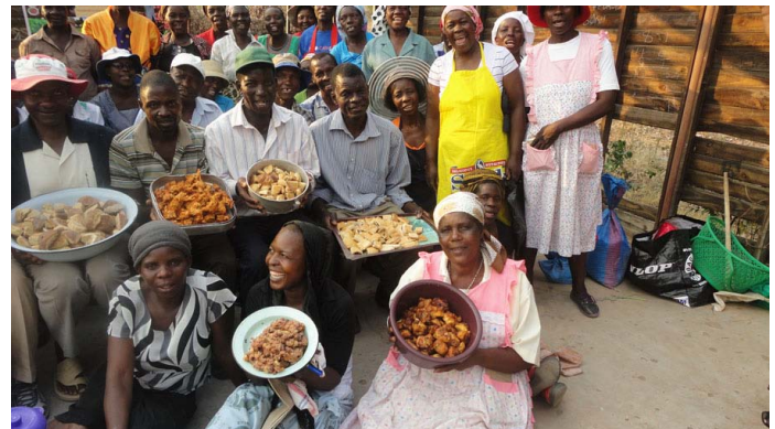
Photo 3 Men and women participate in N2Africa nutrition activities