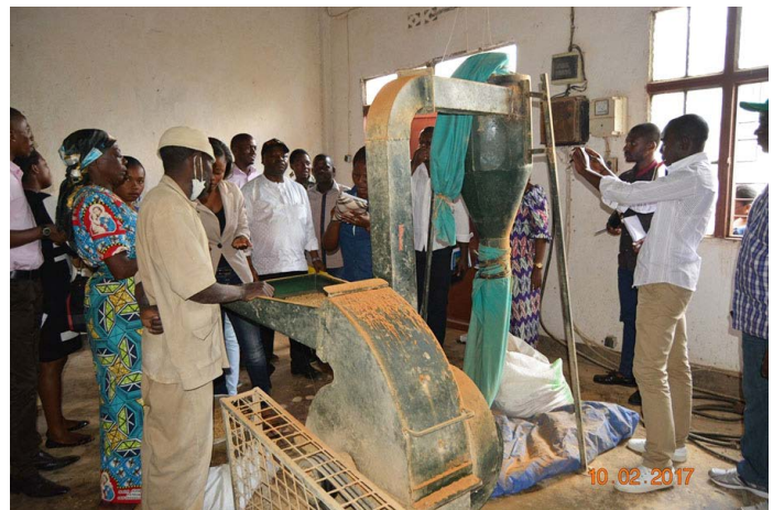
IKYA/UPSKI visit the soya processing facilities at the Centre Olame, Bukavu DRC