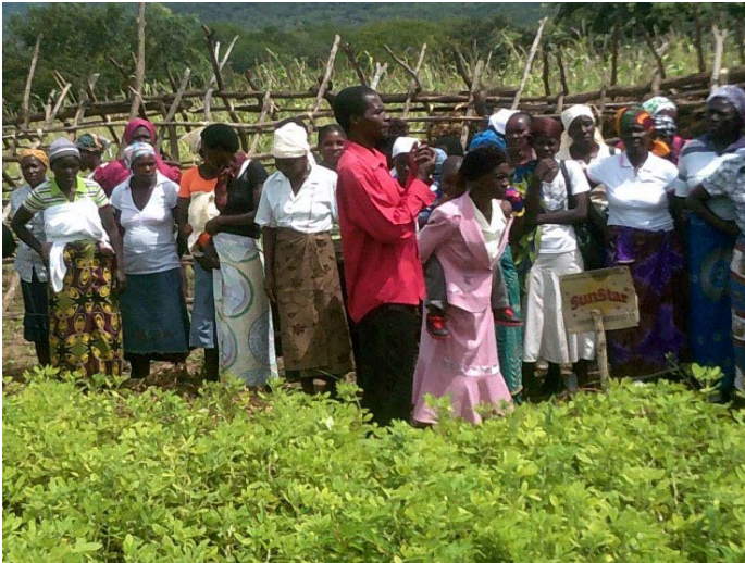
Farmers at a groundnut field day in Mutoko district