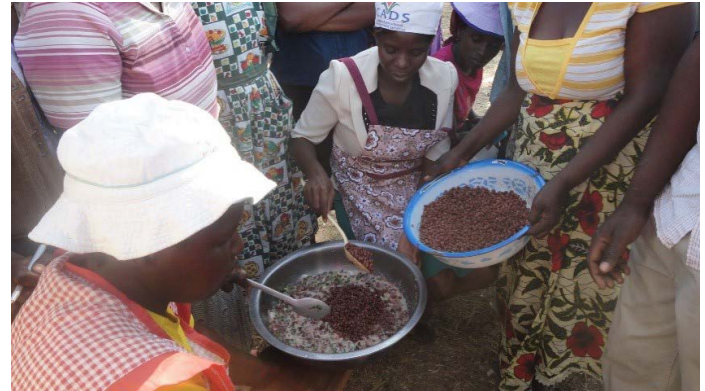
Farmers at a Cooking demonstration in Goromonzi District

produce more grain legumes. Farmers benefitted a lot from the field days, agricultural shows and trainings that were conducted with support from N2Africa.