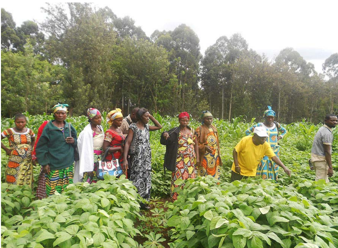
Field visit DR Congo