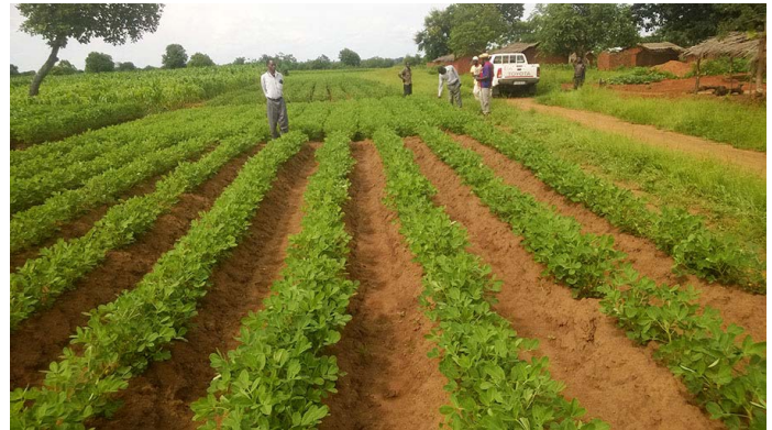
Demonstration plot-single row vs double row planting of groundnuts

Through the four cooperatives established under ICCO/CARD's watch and having built capacity of the cooperatives members, there are high chances of continuity of their