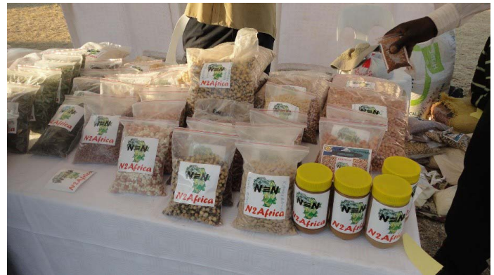
N2Africa branded legume products marketed by N2Africa farmers

The Cluster Agriculture Development Services (CADS) implemented the N2Africa project activities during the last six years, principally in Goromonzi and Mutoko districts. CADS fosters better livelihoods for various communities faced with different challenges. The high HIV-AIDS prevalence has intensified the challenges. One of the entry points