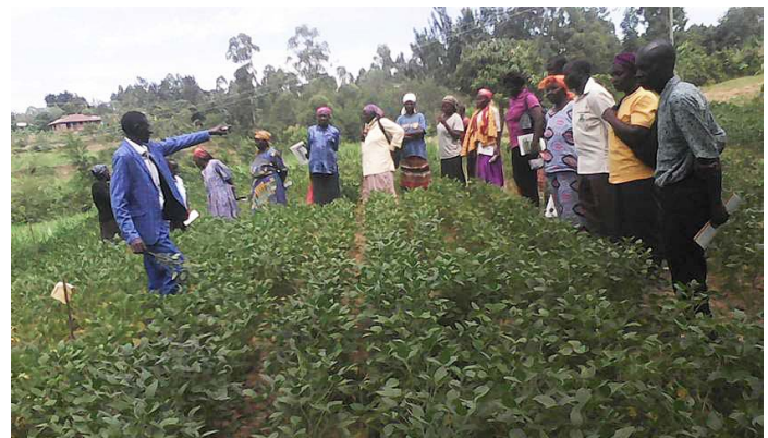
BNF technology demonstration at an OSSOM Customer Open House

The One Stop Shop Operations Mechanism (OSSOM) was started in Kenya at the beginning of 2017 to better link "last mile" agrodealers to commercial manufacturers and distributors of BNF technologies. This move followed three year's reliance upon the Western Region Agricultural Technology Evaluation (WeRATE) as N2Africa's main outreach partner in west Kenya, an umbrella organization comprising 28 farmer associations. We realized that WeRATE was effective at conducting BNF technology tests and organizing farmer field days around them, but did not have the agribusiness orientation necessary to form lasting commercial linkages. OSSOM was formed from 15 WeRATE members that agreed to establish One Stop Shops as registered, year-round business entities dedicated to trade in legume technologies. Many of these businesses also deal in grain legumes and value addition. This shift in focus was