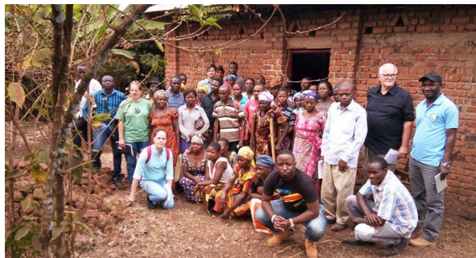
Mission USAID and Tetract in the PAD farmer group IA Luhihi/South Kivu, part of the soyabean value chain

Fifteen years of intensive work on rural sensitization, agricultural extension and structuring farmers' organization have led to successful establishment of farmers' organizations. These organizations are focused on production but also on marketing. PAD's support occurs at two levels: