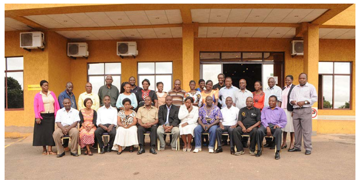
One of the N2Africa and Partners' Review and Planning Meetings

Smallholder farmers under DAES-DADO will be the driving forces at grass-root level in the continuation of dissemination of technologies under the guidance of lead farmers and supervision of AEDCs/AEDOs. At a review and planning meeting held in November 2017 in Lilongwe, officers from these DADOs lined up activities such as mounting of demonstrations by lead farmers, conducting field days and facilitating exchange visits as some of the major highlights in the 2017/2018 season.