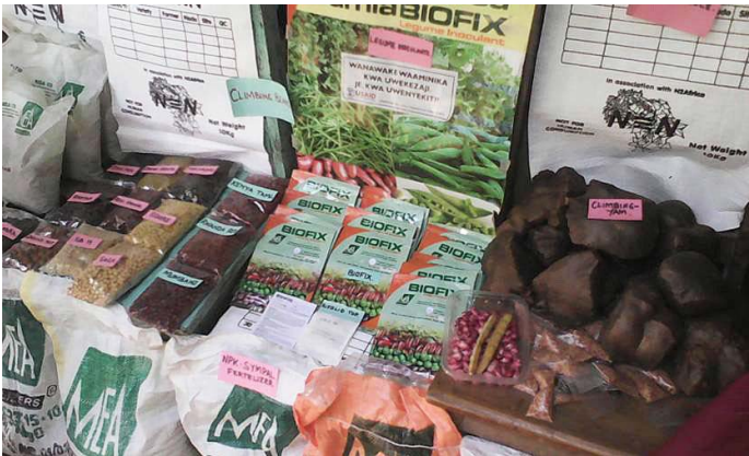
A wide range of commercialized BNF technology products on display in Vihiga, west Kenya.

fertilizers and rhizobial inoculants) were fully commercialized in Kenya. Furthermore, input distributors were actively seeking local stockists to retail their products, and so too were buyers and processors of grain legumes looking for reliable suppliers.