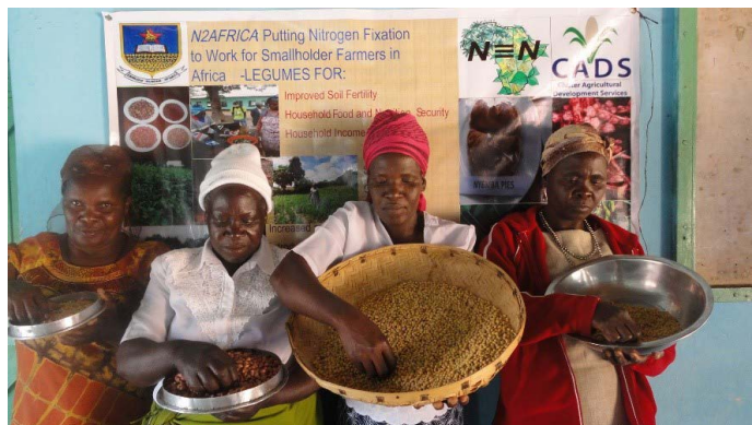
Farmers used grain they had produced to make more valuable products

Smallholder farmers have often failed to access large scale buyers, such as Olivine Industries in Harare, due to small volumes per transaction that are associated with large transaction costs. Training in collective marketing and the formation of viable community marketing associations have removed this bottle neck. Organization of training activities on collective action was anchored at the local level, a necessary recipe for sustainability.