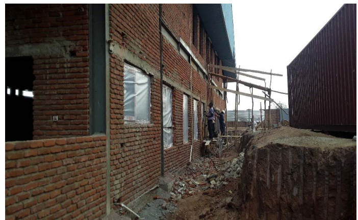
AISL Laboratory under construction in Kanengo Lilongwe. The expected completion date is January 2018 and ready for use in March 2018.

AISL constructed a permanent laboratory which will be fully equipped with necessary laboratory equipment for the production of inoculants. Expected production capacity at the new facility is 1 million sachets. Besides soyabean inoculant, the company started with the development