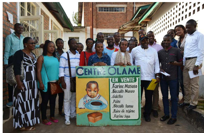
Youth agripreneurs visit the Centre Olame soya processing plant

The focus in this initiative is to further collaboration with youth agripreneurs such as the IKYA/UPSKI and small soyabean producers. These partners are grouped and linked to big processing plants such as Centre Olame and Maizeking in South and North. Centre Olame and Maizeking provide the farmers with good-quality seed, ensuring a good-quality soyabean product to process.