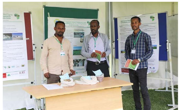
N2Africa products and posters show at the Mini exhibition