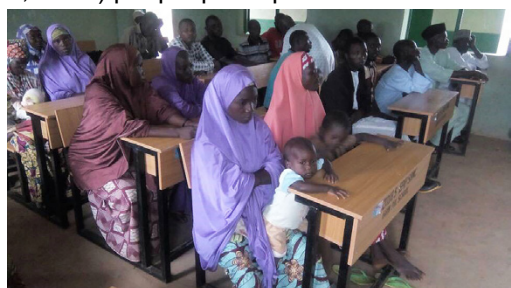
Participants at one of the non-degree training sessions in Borno state, Nigeria

The 2018 community social mobilization exercise which was organized and conducted successfully in 40 new communities within the four local government areas of the project operational areas in Borno state. A total of 3,278 (1,987 M: 1,291 F) people participated.