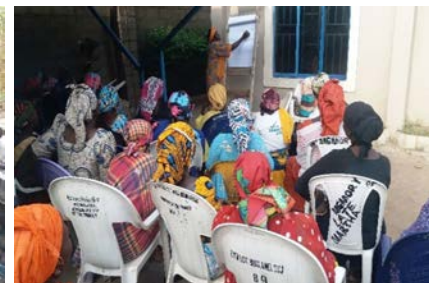
A section of women at VSL training

Industrial training opportunity (internship) on livestock feed milling was offered to six (6) youth agripreneurs (3 –M, 3 –F) in Kaduna at Kabfat livestock feeds, Hybrid feeds Ltd and Olam grains international. This capacity boost has been very useful in the production and sales of poultry feeds among the youth entrepreneurs and their host communities. It has increased production efficiency in broiler production by cutting costs and increasing profitability and business sustainability.