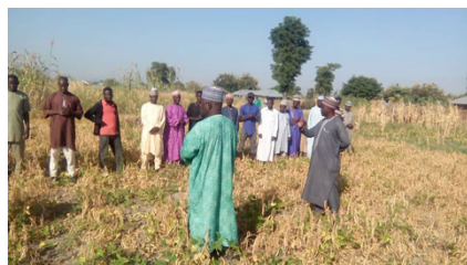
Participants at the mini field days organized and conducted by N2Africa/BOSADP

in 10 locations in the project areas to avail the stakeholders on the various technologies being pushed to farmers as baskets of technology options.