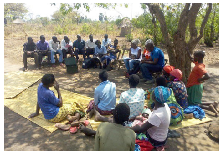
A group assessment meeting by IIRR and Microfinance Uganda services limited for accessing financial loan in Pader, Northern Uganda