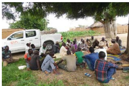
Participants at the 2018 community social mobilization in Borno State, Nigeria