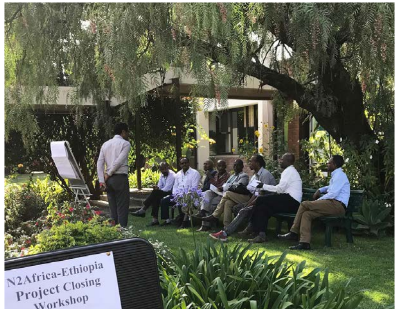
One of the four working group sessions in Ethiopia