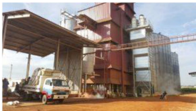
Newly installed Soyabean solvent plant at Singida in Tanzania by MT Meru millers.

Legume growers are linked with the East Africa Grain Council (EAGC) who is assisting with developing and promotion of orderly structured marketing systems and providing farmers with market information across countries in the East Africa region. Soyabean growers through Agricultural Marketing Cooperative Societies in their localities are linked with four big animal feed manufacturers who indicated readiness to purchase 130,000 Mt of soyabean. They include Mount Meru Millers who requires 100,000 Mt, International TANFEED, 10,000 and Highland Millers, 20,000 Mt. On the other hand, leaders' farmer groups have managed to engage 638 producer groups, with a total of