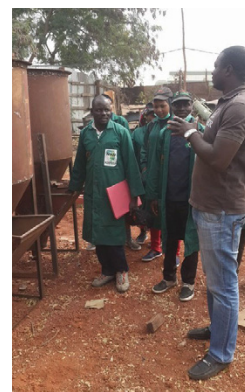
Participants at the industrial training opportunity (internship) on livestock feed milling

Industrial training opportunity (internship) on livestock feed milling was offered to six (6) youth agripreneurs (3 –M, 3 –F) in Kaduna at Kabfat livestock feeds, Hybrid feeds Ltd and Olam grains international. This capacity boost has been very useful in the production and sales of poultry feeds among the youth entrepreneurs and their host communities. It has increased production efficiency in broiler production by cutting costs and increasing profitability and business sustainability.