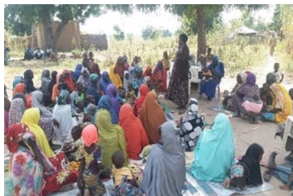
A section of sensitization with women for VSL

To address gender inequality in project intervention, the communities were being sensitized on gender mainstreaming and its importance taking into consideration the context of North Eastern Nigeria and the need to support women, male and female youth to participate in project activities especially business entrepreneurship for better living conditions and to be engaged in Village Savings Loans (VSL) scheme.