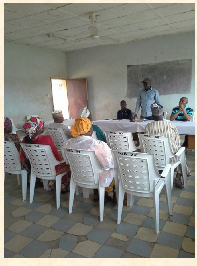
Training of extension officers in collecting information