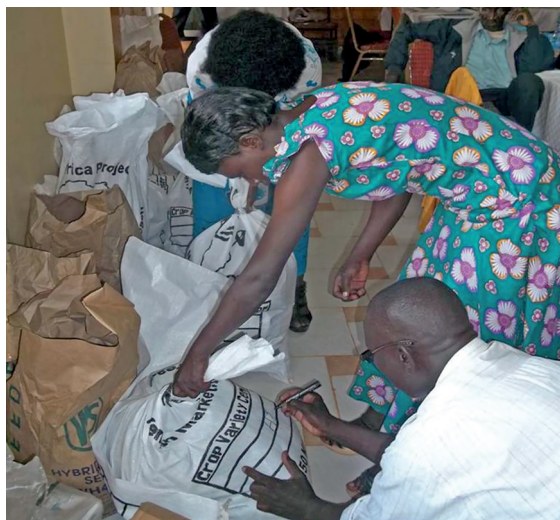
Figure 6.3 Participants at the WeRATE Planning Workshop and Second Agricultural Technology Clearinghouse for the 2015 long rains assembling test kits

It is only fair that, when projects engage WeRATE for multi-site technology testing and popularization of new farm technologies, they also consider the stated needs of the NGO and its members. As a result, in response to growing