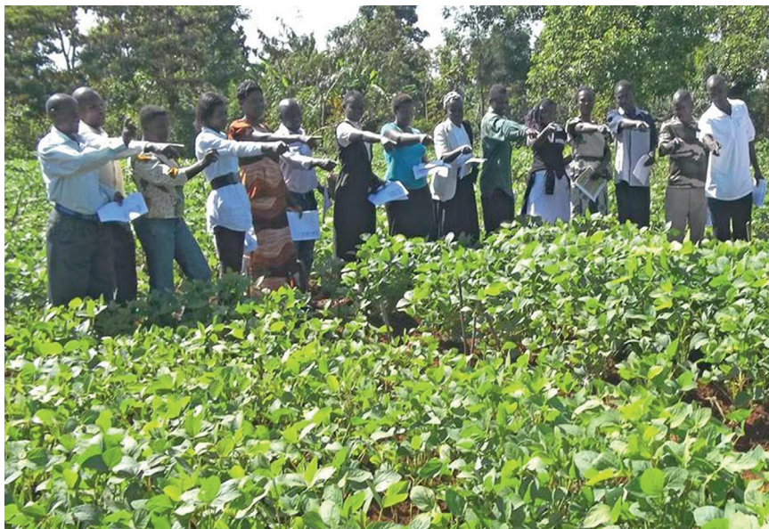
Figure 6.4 WeRATE members identify preferred soybean management system – rust tolerant cv Squire variety – during farm liaison training

Preliminary results from these on-farm tests (Table 6.2) suggests that the recommended N2Africa technology package performs well (+314 kg/ha), is further enhanced through the addition of biochar (+134 kg/ha), due in part through modest disease suppression, and is greatest when mineral nitrogen is also applied (+136 kg/ha). The economic response to biochar is uncertain, however, as no commercial stocks are available so it remains difficult to price this experimental input. Subscribers not only demonstrated an ability to assess yield and nodulation, but also ranked severity of pests and disease (Figure 6.4).