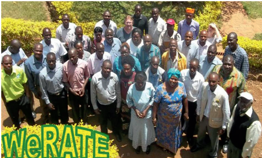
Figure 6.1 Participants at the WeRATE Planning Workshop for the 2015 long rains and Second Agricultural Technology Clearinghouse