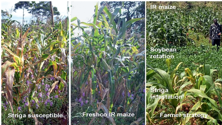
Figure 6.5 WeRATE striga management approaches and farmer response: maize is overwhelmed by intense striga infestation (left) that is greatly reduced by IR maize (centre). Farmers synthesize field experience to develop a practical, inexpensive strip-crop approach to striga elimination (right)