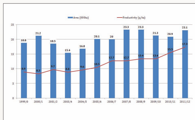
Figure 1. Productivity and production improvement of chickpea in Ethiopia (Source: Central statistics authority of Ethiopia 2000-2012).

ACOS cannot satisfy the demand for chickpea. They are working to increase their network of traders and exploring options such as contract farming with smallholder farmers