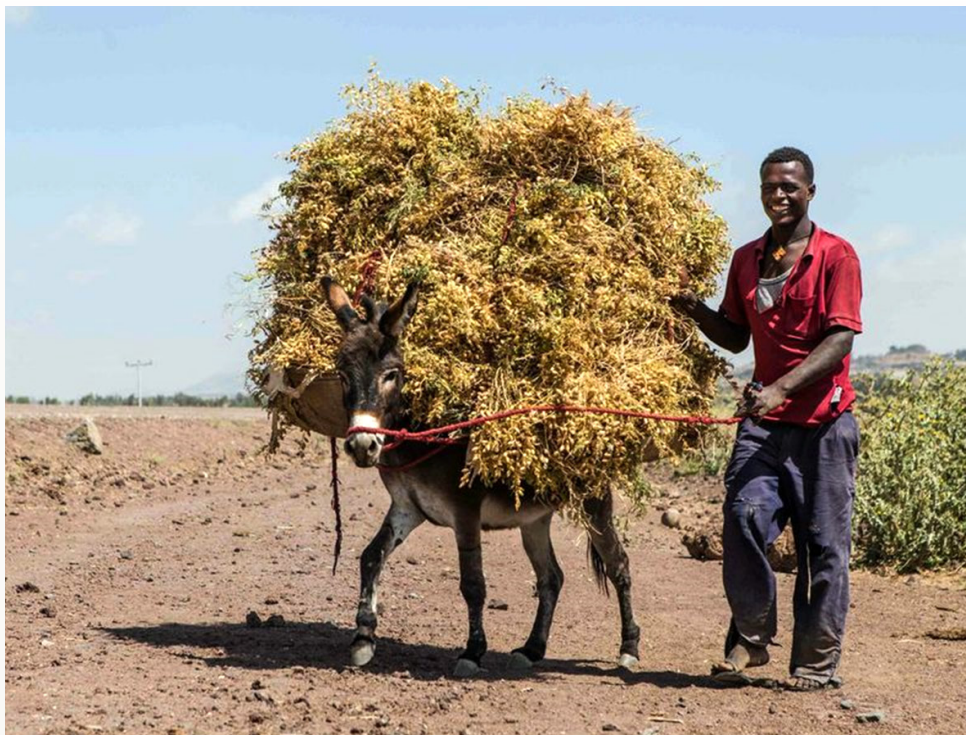
Ethiopian farmer carrying his produce home.

As new varieties have been developed and adopted, there has also been a major shift in chickpea cropping practices. Chickpea was traditionally grown using residual moisture and