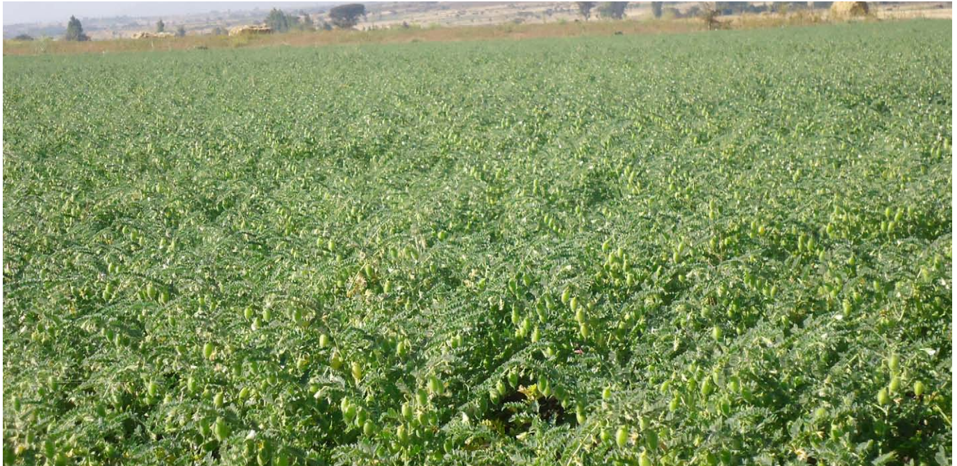
Changing landscape as chickpeas replace significant areas previously under the cereal teff.