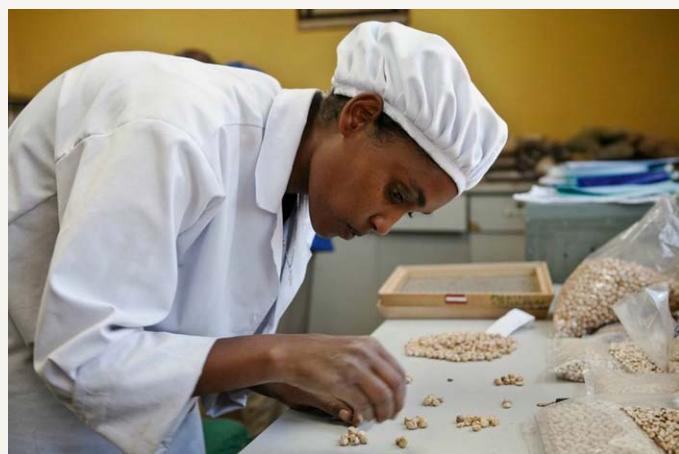
The Agricultural Commodities Supply (ACOS) Company provides the link between the farmers and export market – in addition to employment.

chickpea continues to change hands in a varying number of transactions as small traders like Melesse sell to larger brokers who bulk up the chickpea into more desirable amounts for export companies who need to trade in large volumes.