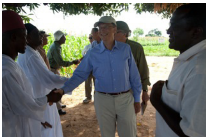
Bill Gates and Jeff Raikes arriving and being greeted by IITA's test sites at Bichi on 28 September 2011. They were accompanied by Sam Dryden (not seen) of BMGF

N2Africa works with farmers to improve productivity in smallholder farms through the increased cultivation of