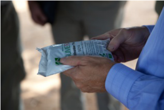
Bill Gates holding a packet of inoculant while being briefed by IITA staff during the visit to IITA's N2Africa test sites at Bichi on 28 September 2011

was treated with both inoculant and phosphate fertilizer. Dr Bala further explained that the demonstration had 4 objectives; (i) to demonstrate to farmers that soyabean could be cultivated in the area in spite of the relatively short cropping season. The benefit of growing soyabean is that it diversifies the cropping system and source of income to the farmer, has residual benefit to the soil, helps in controlling "witchweed" - the parasitic plant Striga - and provides fodder for livestock; (ii) that proper crop management is a key requirement for good crop performance; (iii) to demon-